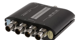
1-IN 4-OUT HD-SDI SPLITTER