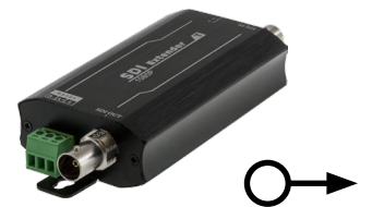
TX HD-SDI + RS485 + POWER