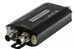
1-IN 2-OUT HD-SDI SPLITTER