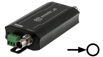
RX HD-SDI + RS485 + POWER