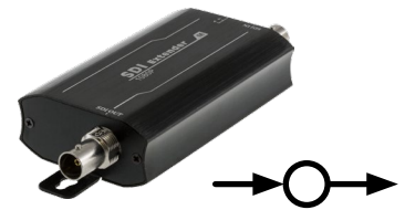
RPT HD-SDI + RS485 + POWER